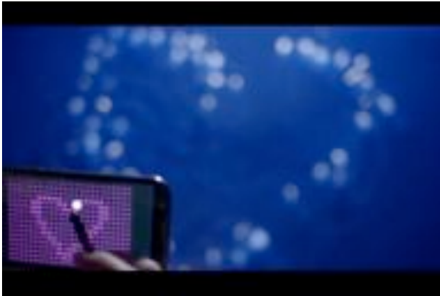
Figure 2. Liquid Pixels by Daniel Kupfer for Samsung

represents a pixel on the phone display, the participant can write or draw on the smartphone's screen and see it manifest on the water surface.