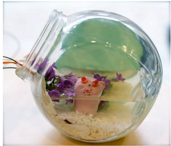
Figure 4. Demonstration of prototype

prototype is meant to simulate the feeling of haptic feedback used in water.