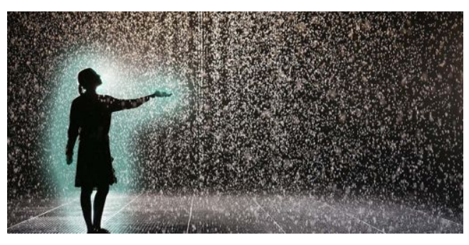
Figure 4: Rain augments the illumination of the skin (Edited)

As stated above, the process of the cognition in relation to the perception would change with the transformation of the sensory input. The world around the user changes so the information we process is different; still we perceive and process with the same brain. How would the behavior behind the action change, for example the touch of the skin itself, would it be yet a meaningful action that adds expression to the appearance?